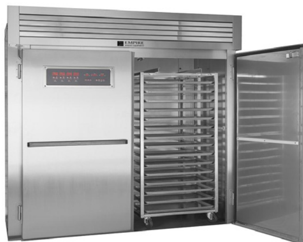
Model LRP3-40 Shown (rack not included)